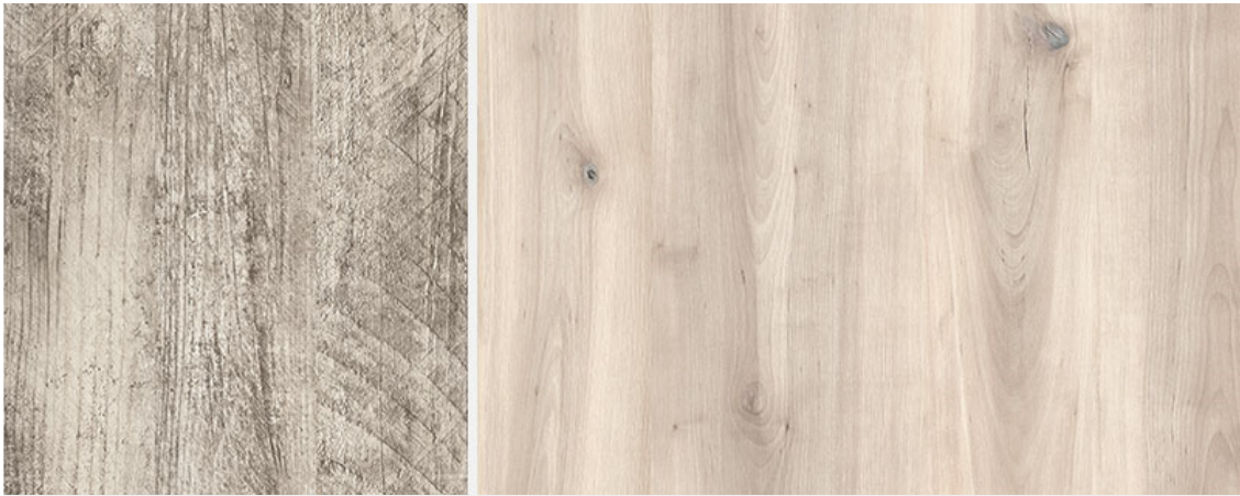
Blomquist and Aurum (f.l.t.r.)

With the new decor Aurum , we provide the antithesis of rusticity. We create an oasis of peace, the epitome of elegance and harmony. Fine cracks and knots gently interrupt the delicate, homogeneous design.